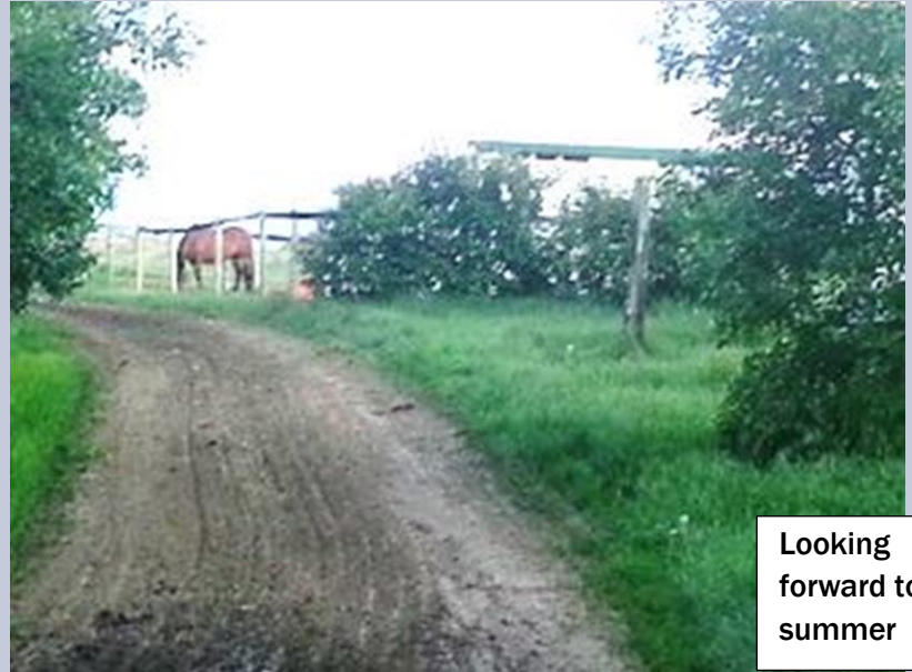
Looking forward to summer