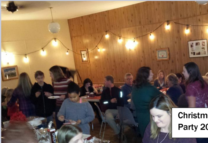
Christmas Party 2016